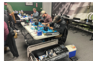
Right, Top to Bottom: Subterranean Complex, Classroom/Student Stations